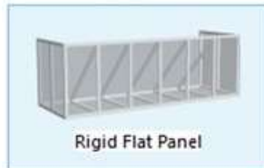
Rigid Flat Panel